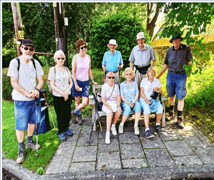
The Ambling group pictured on a walk around the Kemsing area towards the end of July.