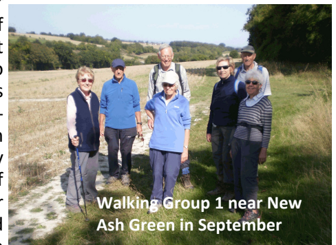
Walking Group 1 near New Ash Green in September

Walking has always been a major part of our activities, but some of those groups have been finding it hard to attract new members to replace those who find themselves wearied by age. Walking 1 is an all-day group that has been walking ten miles on the 3 rd Friday of every month since the very early days of Sevenoaks U3A. Sadly many of their members have fallen away and none of those who remain is able to