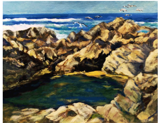
Rockpool in Cornwall by Wendy Lankester