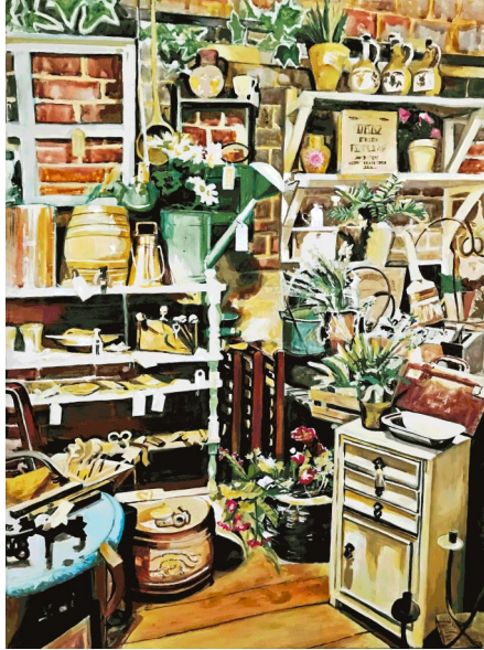
Antiques at Snape Maltings by Lynda Charlton