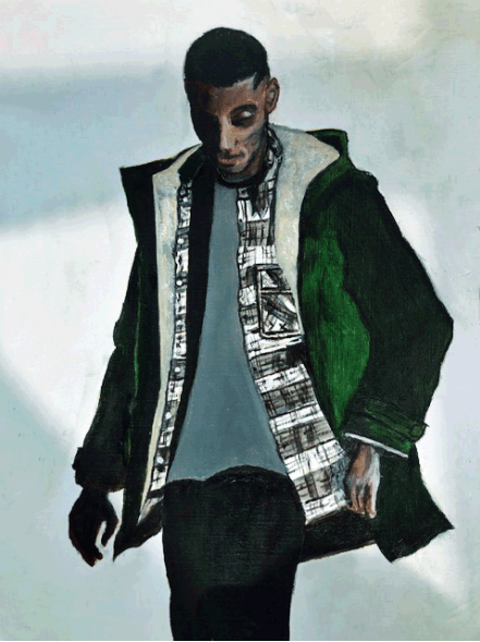
Fashionista by Faith Stanley

The group members were not idle during lockdown, and the pictures shown below were painted during the lengthy period when we were not able to meet.