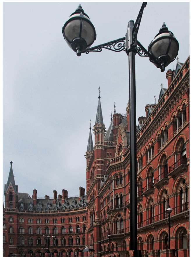
Photo from the King's Cross Regeneration trip in April (see p3 for report)