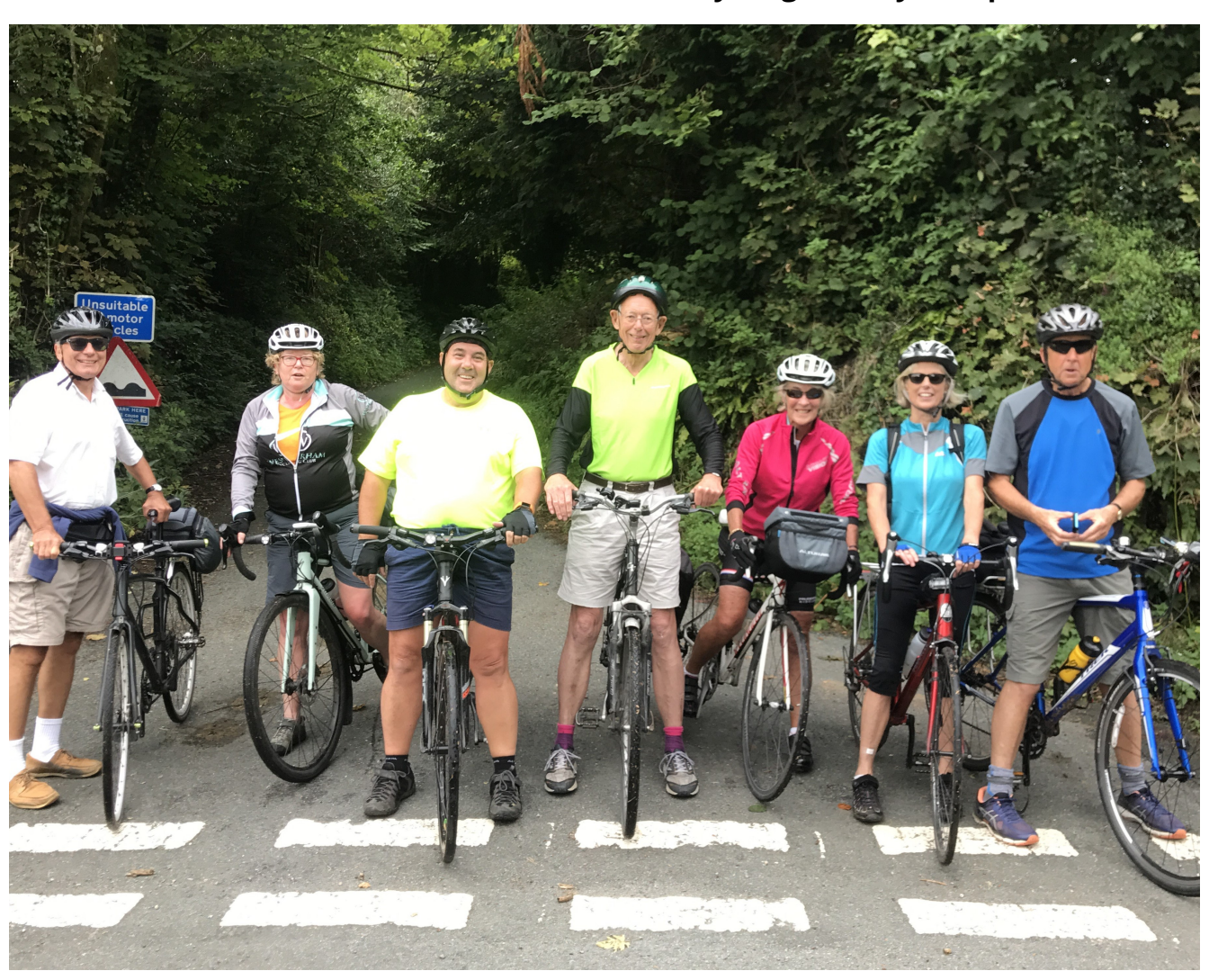
"Lost in Dartmoor"